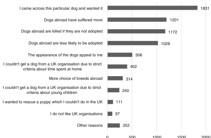
Figure 1 Reported reasons why participants adopted dogs from abroad.

‘It’s like computer dating on Facebook. You see a dog – you read their story – you fall in love’