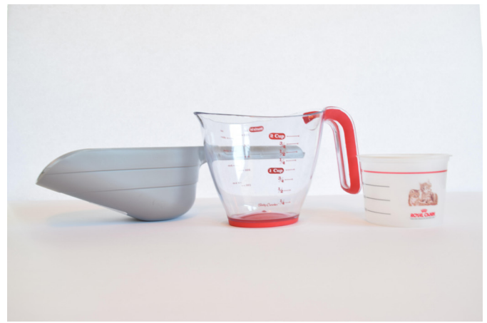
Figure 1 Participants were assigned one of the following measuring devices (from left to right): a two-cup commercial food scoop (Petmate, Arlington, Texas, USA), a two-cup graduated-liquid measuring cup (Betty Crocker; General Mills, Minneapolis, Minnesota, USA) or a one-cup dry-food measuring cup (Polytainers, Toronto, Ontario, Canada), and were asked to measure 1/4, 1/2 and 1 cup of a dry dog food.

The second section of the questionnaire was developed to be used following participant's completion of a dry dog food measuring activity. The second section asked participants, using a visual analogue scale (0, never; 100, always), their likelihood of using the