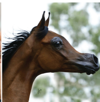
Extreme breeding in horses, p 390