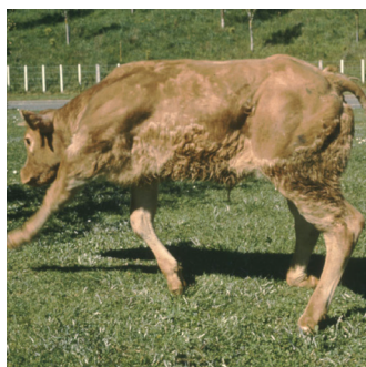
Identifying and diagnosing neurological disease through case work up, p 368