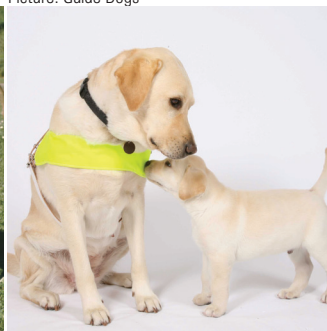
No evidence of seasonality in oestrus found in an assistance dog breeding colony, p 371