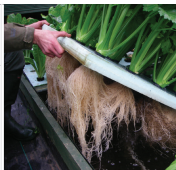
Aquaponics – an ecofriendly means of farming fish, p 605