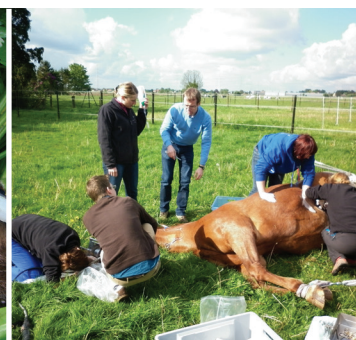
Using opioids during field anaesthesia in horses, p 621